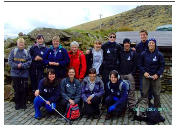
Sponsored ascent of Snowdon