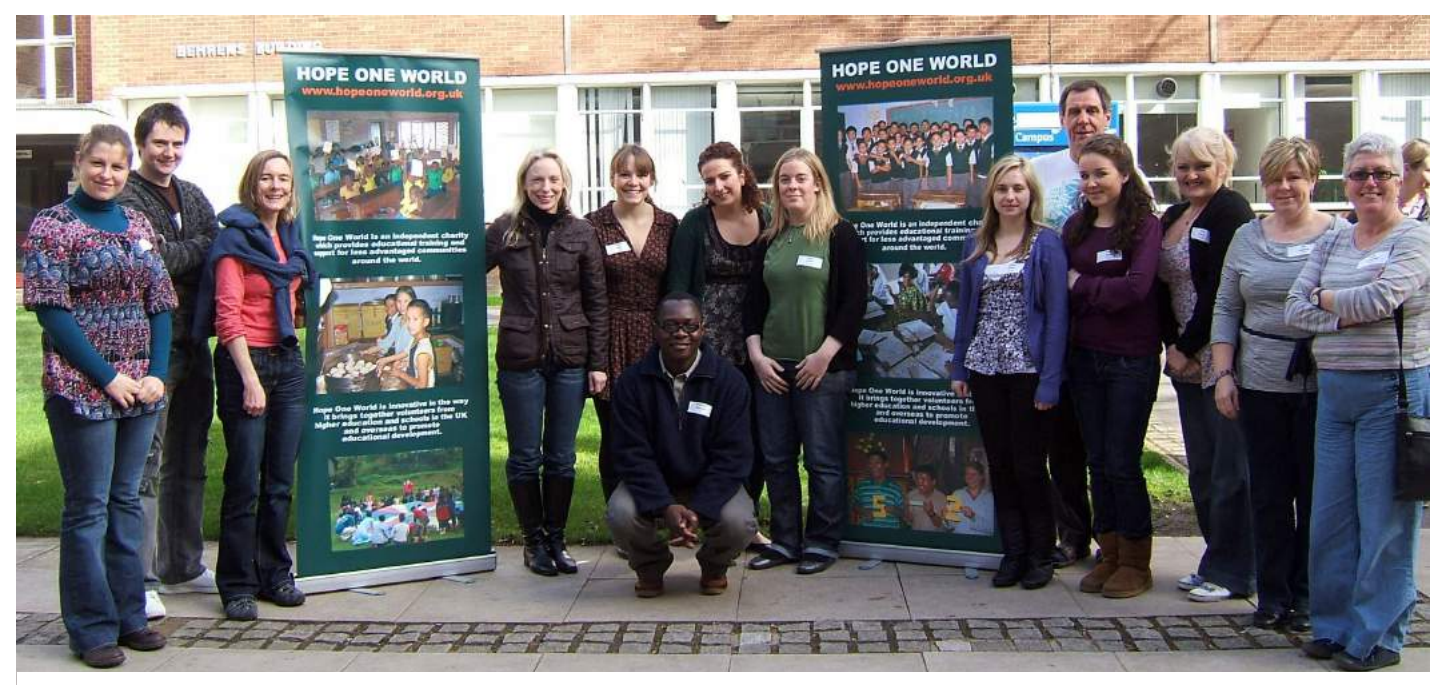
Planning meetings for HOW tutors and students

Training days have been taking place at Manchester Metropolitan University (MMU) and also in Liverpool for staff and students who are going on projects in July and August 2009.