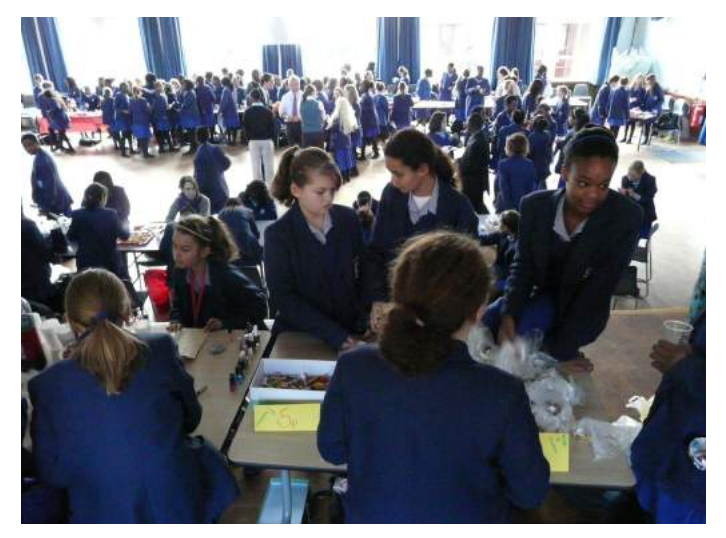
Ursuline High School, Wimbledon